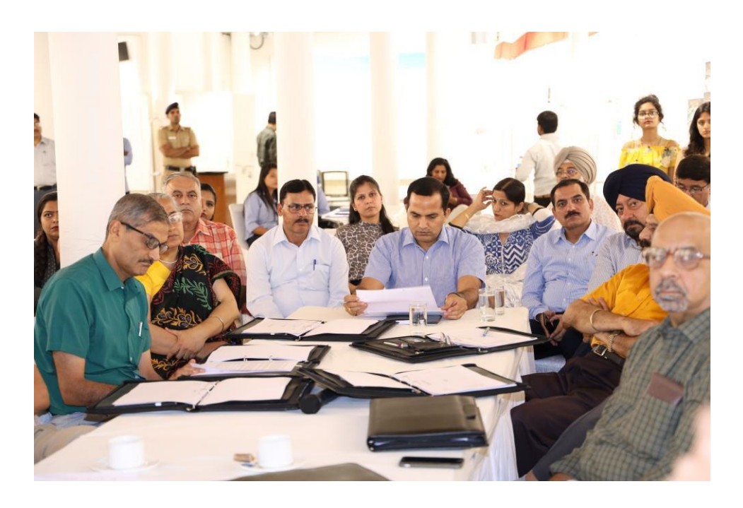
Jury members during presentation by a shortlisted participant.