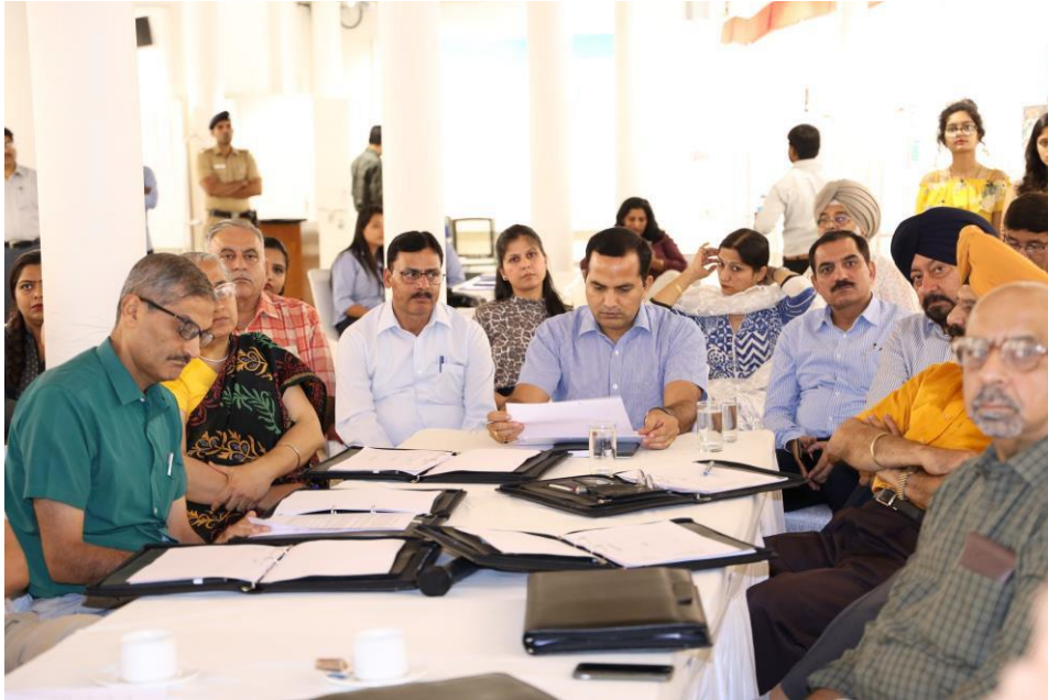
Jury members during presentation by a shortlisted participant.